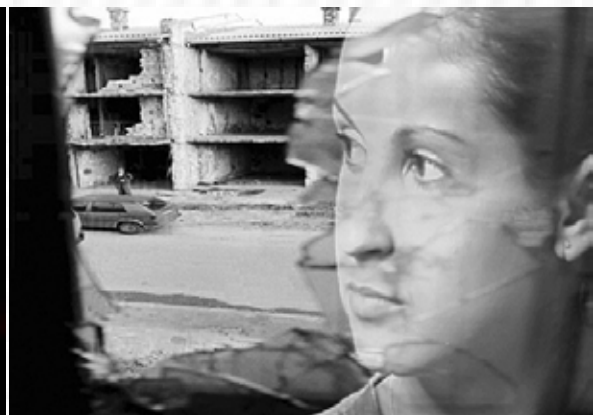
From Left to Right: Who Wants to be a Millionaire? held auditions in Kansas City; Matt Damon to star in Informant! alongside Kirkwood native Scott Bakula; A still from Neither Here Nor There