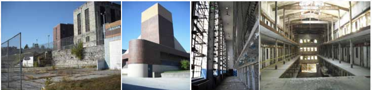
Photographs of the old Missouri State Penitentiary