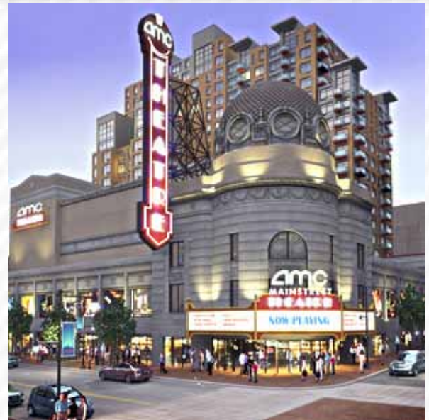
Kansas City's new AMC Mainstreet Theatre, located in the Power & Light District, hosted the Kansas City FilmFest in April.